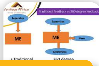
LEWA Conservancy-360 Degree Appraisal

LEWA Wildlife conservancy doesn't believe in traditional appraisal methods. When they engaged us to develop a state of the art 360 degree performance appraisal system, we knew we were contributing towards conservation efforts in Africa, and we gave it our best. Here, we are training the senior management team on how to use the system. We were joined by some antelopes in the background.