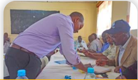
World Bank Funded Training for Community Leaders

Kakuma refugee camp hosts refugees from South Sudan and other neighboring countries. Many organizations operate there with an aim of providing relief services and preparing the refugees to be productive citizens should they choose to go back to their countries. On this occasion, we trained staff from LWF/DS on Project Monitoring and Evaluation in Kakuma, Dadaab, Nairobi and Kismayu. It was a highly successful training.