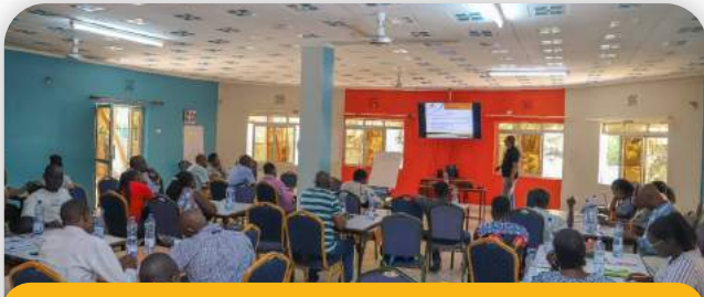
LWF/WS Training on M&E

Kakuma refugee camp hosts refugees from South Sudan and other neighboring countries. Many organizations operate there with an aim of providing relief services and preparing the refugees to be productive citizens should they choose to go back to their countries. On this occasion, we trained staff from LWF/DS on Project Monitoring and Evaluation in Kakuma, Dadaab, Nairobi and Kismayu. It was a highly successful training.