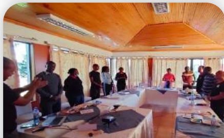
RAA Ltd Leadership Training

LEWA Wildlife conservancy doesn't believe in traditional appraisal methods. When they engaged us to develop a state of the art 360 degree performance appraisal system, we knew we were contributing towards conservation efforts in Africa, and we gave it our best. Here, we are training the senior management team on how to use the system. We were joined by some antelopes in the background.