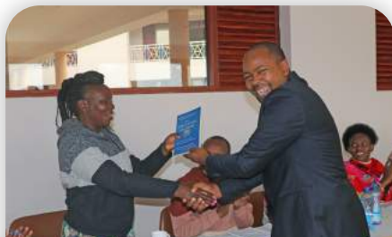
Caritas Nairobi Project Officers Training

Kenya Conference of Catholic Bishops (KCCB) approached us to train their project officers on Resource Mobilization and Proposal Writing. We later trained them on Corporate Governance, and then on Microsoft Project. Most of our clients always come back for more trainings after experiencing our services.